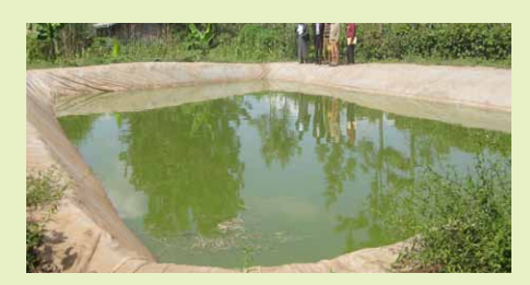
Stocked fish pond in Tigania West Sub-County

For increased fish production and promotion of fish farming, the county has developed 140 fish ponds across all the nine sub-counties. This translates to 15 to 20 ponds per sub-county. Fish production from the 140 fish ponds is expected to increase the overall annual fish production by an estimated 28,000 Kgs. Annual fish production from Meru County currently stands at 300,100 kgs, valued at 84m. The target is to produce over 1,500,000 kgs of fish annually.