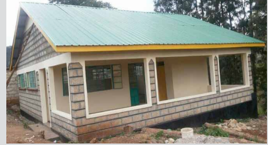
The old ECDE classrooms