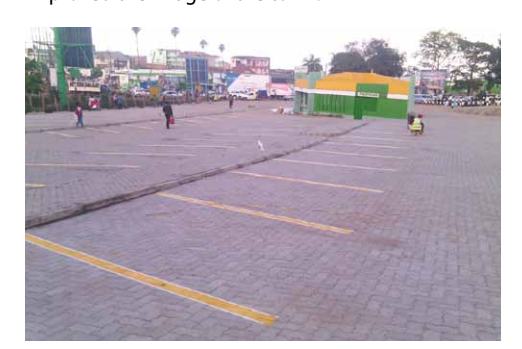
Project Sum - Kshs 16.4 Million

The project involved improvement of surfaces of the bus park which were natural earth to cabro surface standards. This increased the parking capacity in the town and eliminated the perennial problem of dust and mud which were a nuisance and health hazard to operators and commuters alike. The project has improved the image of the town.