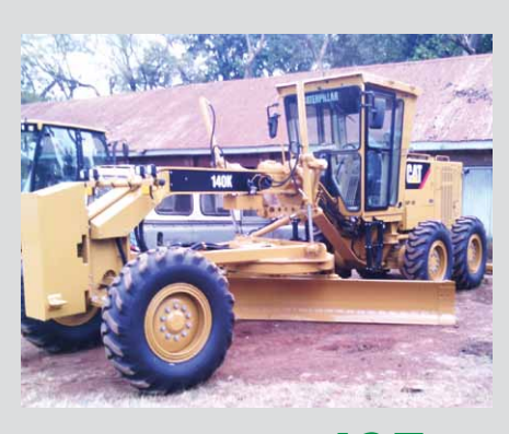
Project Sum - Kshs 137 Million

The county has acquired 2 motor graders, one tracked dozer, one buckhoe, one prime mover, one Lowbed carrier, one tipper and two supervision pick ups. With these machineries we have been able to open over 250km of new roads, graded over 700km of roads. The prime mover and low bed carrier has assisted in cutting down the cost of mobilization of machinery by the County Government. This financial year we are acquiring 2 graders, 2 tracked dozers, 2 tippers, 1 drum roller, and 1grid roller, 1 water bowzer and 5 supervision vehicles.