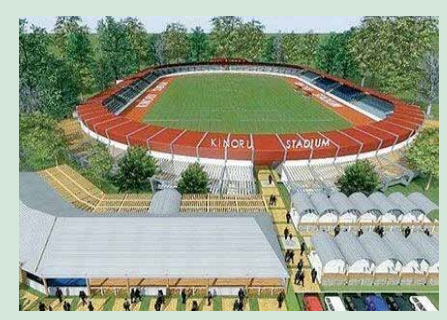
An Artistic impression of the complete Kinoru Stadium.

The meru rugby seven was the first of its kind event in Meru County. The event was supported by the county government of meru, the event came to life on the heels of launching the meru rugby club that has been nurturing talents for young rugby players in the county.